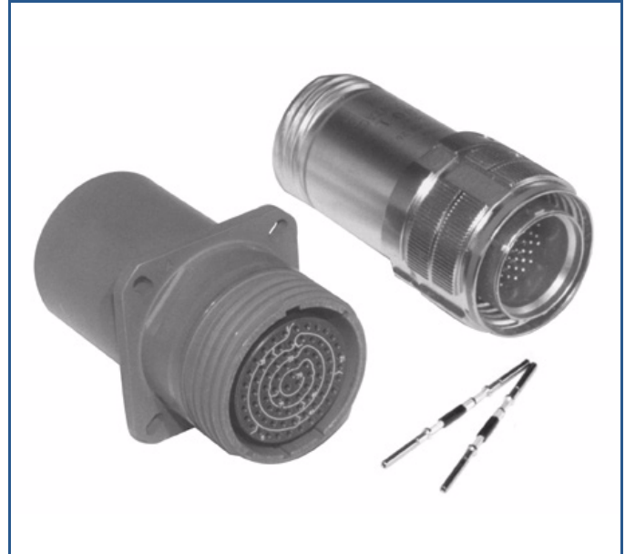
Diode Connector and Adapter

Publication SL-360 offers in-depth information concerning front repairability of diode connectors.