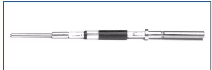
Close-up View of Diode Contact