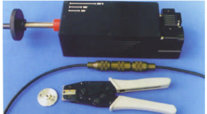
Impact and crimp tooling